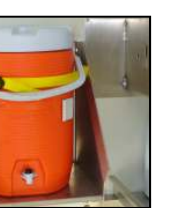
Wall mounted water cooler rack