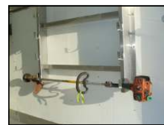
Horizontal trimmer rack