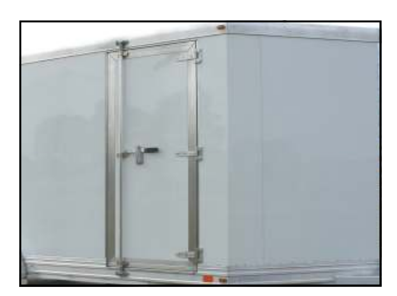
Side door with Aluminum anti-rack cam lock