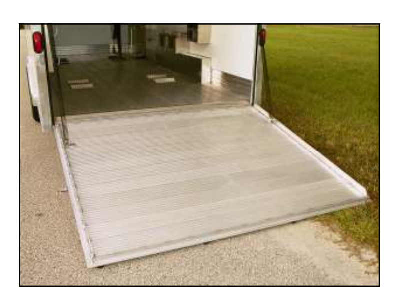
Extruded Aluminum Ramp Deck with spring assist lift

Alumne Manufacturing is a leader for Aluminum Trailers in the green industry. Our trailers are made from high-quality, corrosion-resistant Aluminum Extrusion specifically designed to be lighter, stronger, and more durable. With fuel cost going higher every day the Alumne Lawn Maintenance Trailer is the ultimate solution for lawn maintenance contractors. It has an all aluminum frame structure, increasing pay load, eliminating preventive maintenance and maintaining its value. The entire trailer can be cleaned with pressure washing. All lighting is LED and the electrical system is sealed. By combining these innovative techniques along with proprietary Alumne extrusions, Alumne Manufacturing has created the best trailers in the industry.