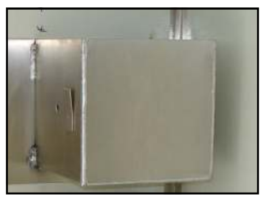
Trimmer string rack