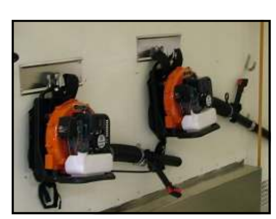
Back pack blower rack