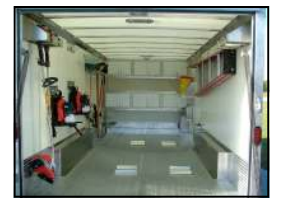
Cabinet & racks