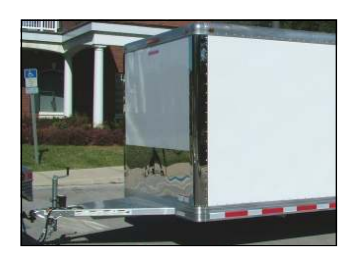
ATP OR SS Stone guard