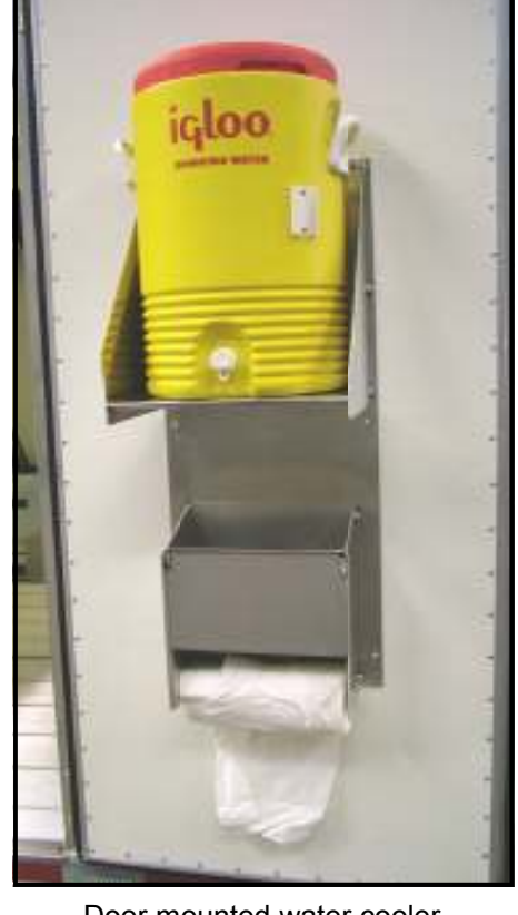
Door mounted water cooler & hand cleaning station rack