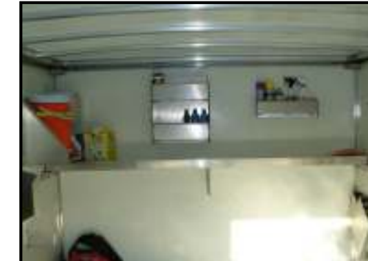
Front work bench