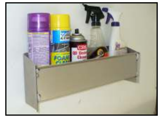
Pistol grip bottle rack