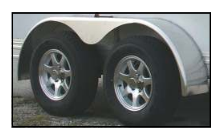
Optional aluminum spoke wheels